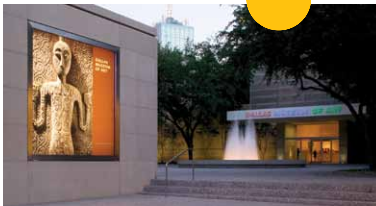
DALLAS MUSEUM OF ART

Two great free options are the Dallas Museum of Art , which is one of the premier art museums in North America, and the Crow Collection of Asian Art , whose surrounding gardens, with their serene water features, are a highlight.