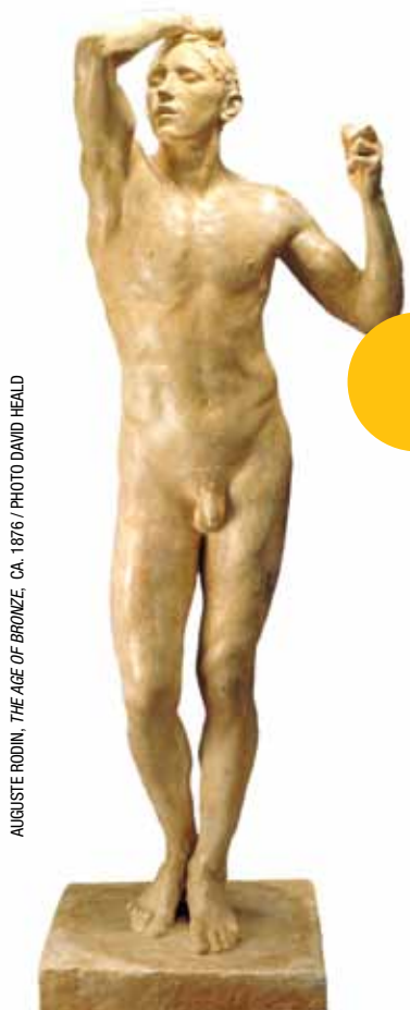
AUGUSTE RODIN, THE AGE OF BRONZE, CA. 1876